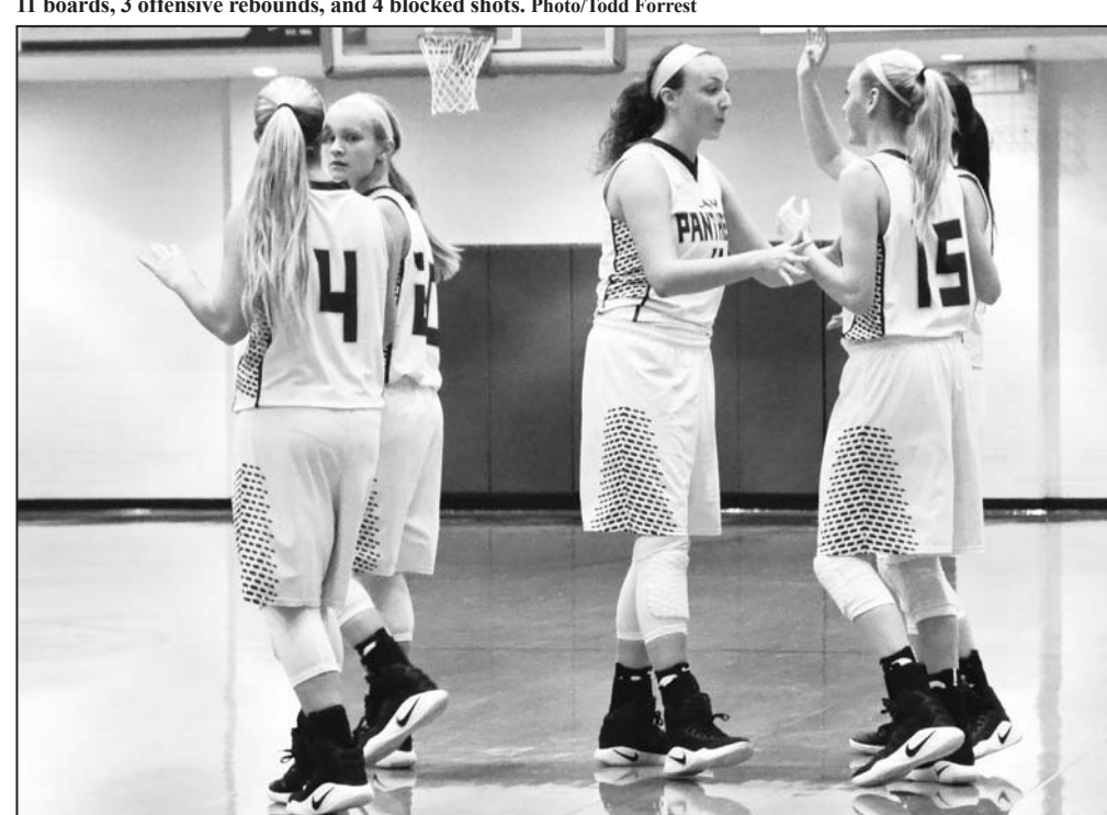
The Lady Panthers return to the court following a second half timeout.